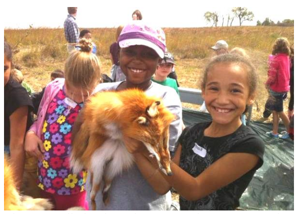
The Hubbell third graders recently participated in Star Prairie.

Also help keep Hubbell students safe by encouraging your children to safely walk their bikes and carry their skateboards by the building and along the Hawk Walk where there are so many people. Thanks for supporting the safety patrols.