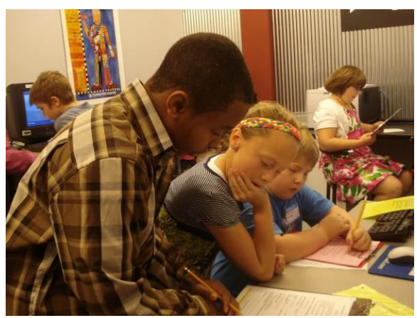
Biz Town workers