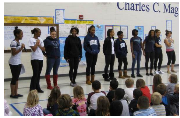
Roosevelt Dance Squad performed at a PBS assembly.