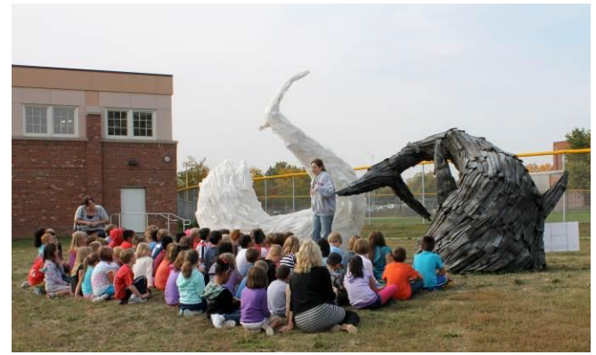
Art Stop created a sculpture on the Hubbell field.