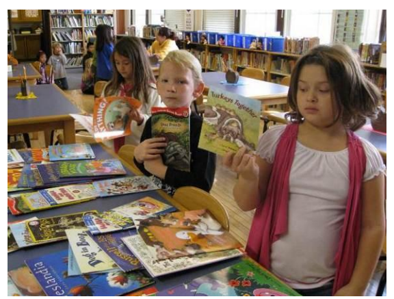
Hubbell students thank the PTA for the great books at the PTA book give-away.

With cold and flu season approaching, students may be bringing medication to school. Please remember that ALL prescription and nonprescription medications must be sent to school in the original container. Non-prescription (over-thecounter) medication must include a note from a parent AND the doctor indicating the name of the medicine, the dosage, and how many days the medicine should be given. Prescription medicine must be sent with the prescription label attached and requires only written parental/quardian consent. If a prescription medication is to be given, please ask the pharmacist for an extra bottle for school, and send just the amount needed for school use. All medication must be kept in the nurse's office. Students are not permitted to have medication in their possession during the school day. If you have any questions, please call the nurse's office.