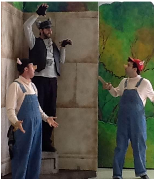
Opera Iowa's performance of The Three Little Pigs

Opera Iowa performed the children's opera, The Three Little Pigs . In preparation, all students learned a chorus to sing along with the opera. They also learned about opera music, Mozart and some of the characters that are in his most famous operas. Some of the characters in "The Three Little Pigs" were named after them!