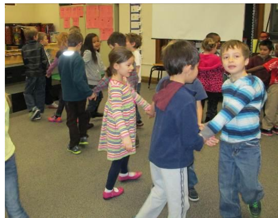
"First graders practice dance for their Spring music program, "Making Friends".

The end of the school year is quickly approaching, please help your student locate or pay for any overdue library books. If a book is paid for and then found, your money will be refunded. The fine for lost paperback books is $2.00. The cost of hardback books is based on the age and condition of the book. I will send notes home for any overdue books with the title and cost listed.