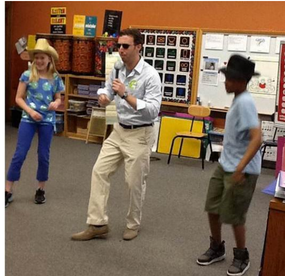
Opera Iowa presented a workshop on singing styles