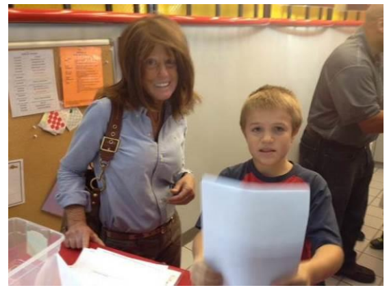
Working in the restaurant