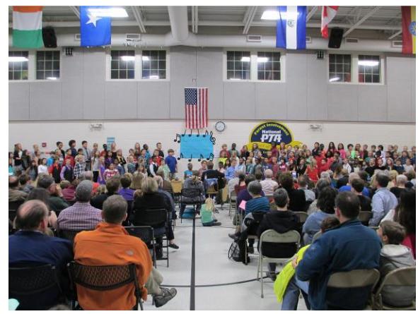
Great attendance at the music performance