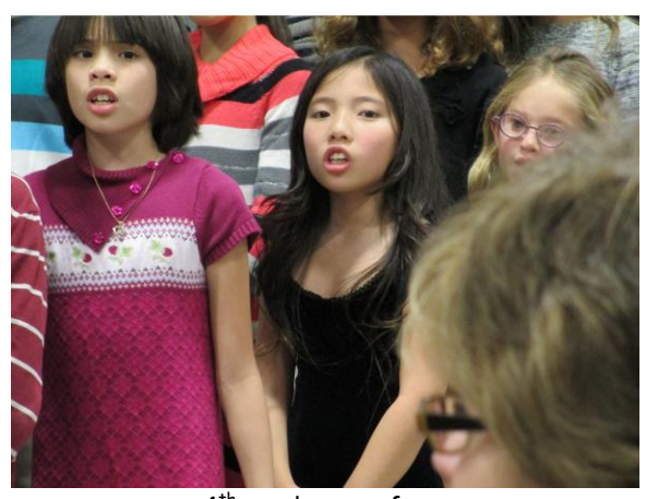
4th graders perform