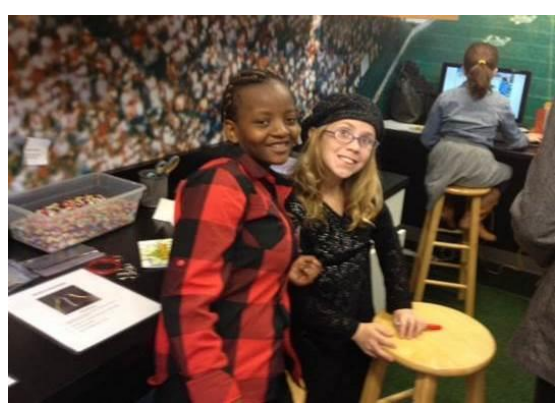
In the sports store